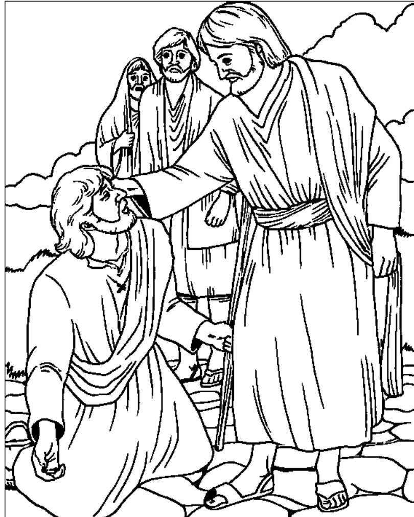
Jesus Heals a Blind Man Mark 10:46-51

From BibleStoryCard Learning System™ Coloring Book © 1996 Wesleyan Publishing House http://www.parable.com/wph/group_1052.htm